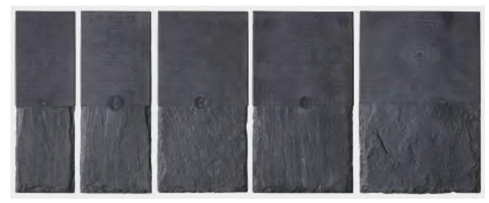
Figure 1: (a) DaVinci Multi-width Slate

"DaVinci Multi-width Slate," "DaVinci Single-width Slate," "DaVinci Multi-width Shake," "DaVinci Single-width Shake," "Bellaforté Slate," "Bellaforté Shake" are engineered polymeric plastic-based roof tiles designed to provide the look of natural slate or shake. The products are manufactured with a proprietary formulation using thermoplastic olefins and are available in assorted colours. The DaVinci Slate shingles are manufactured in widths of 152 mm, 178 mm, 229 mm, 254 mm and 305 mm with a total length of 457 mm (152–203 mm of exposure depending on roof pitch and coursing). The DaVinci Shake shingles are manufactured in widths of 102 mm, 152 mm, 178 mm, 203 mm and 229 mm with a total length of 559 mm (229–254 mm of exposure). The Bellaforté shingles are manufactured in a single width of 346 mm and are a total length of 394–413 mm (305 mm exposed). The Select Shake shingles are manufactured in 203 mm and 254 mm with a total length of 559 mm (229–254 mm of exposure).