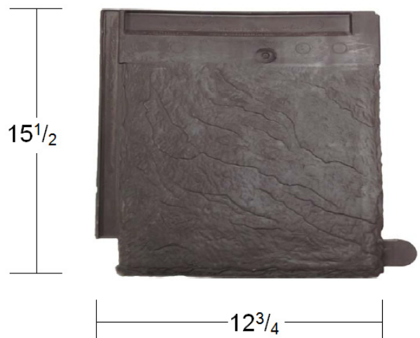
FIGURE 3—BELLAFORTÉ SLATE