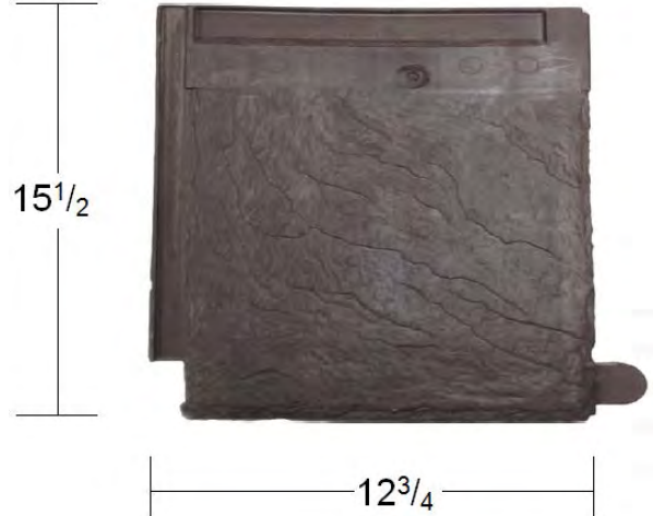
FIGURE 3—BELLAFORTÉ SLATE