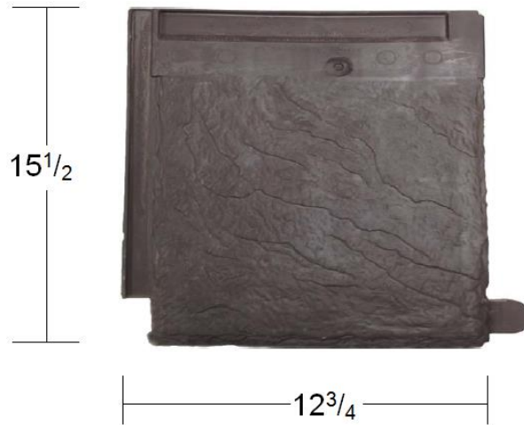
FIGURE 3—BELLAFORTÉ SLATE